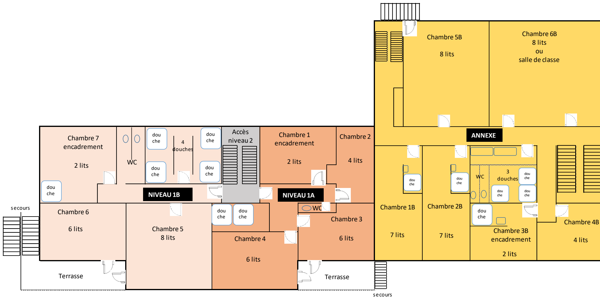
Niveau 1 (34 lits) + Annexe (28 ou 36 lits)